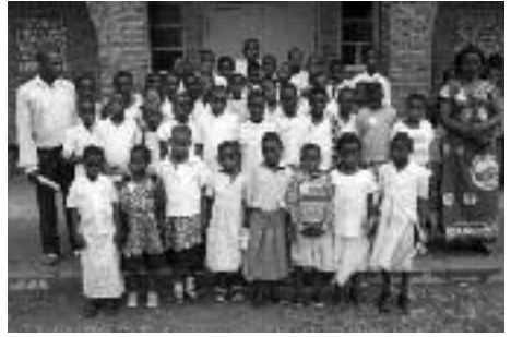
Catechist Class at Corpus Christi