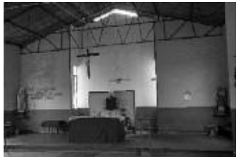
Our Lady of Fatima Parish Church, Chipoka

large heaps. As Lake Malawi is on the Great African Rift good foundations are essential and this is where the funding is required, approximately £8,000 for a block of two classrooms. Once suitable foundations are laid the parents will happily help build the classrooms for their children.