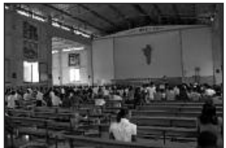
Corpus Christi Church: exterior and interior views