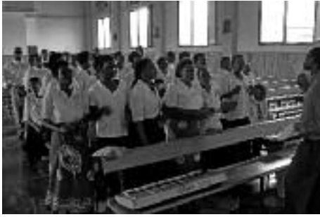
Corpus Christi Choir