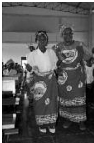
Corpus Christi Choirmaster and Procession