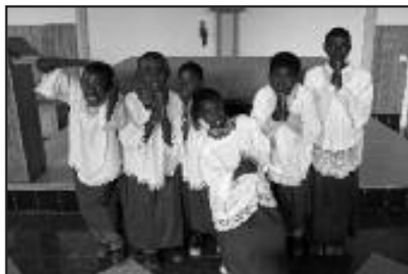
The Altar Servers at Corpus Christi

Sitting on the flight to Nairobi waiting for the aircraft to be de-iced I just could not believe that within 14 hours I would be in Lilongwe, the capital of Malawi.