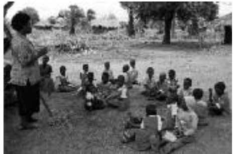
Classes under the shade of the trees